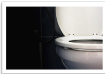
Global Sanitation and Sustainability Project