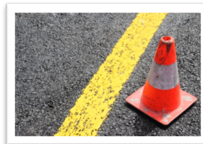
Global Road Safety Project