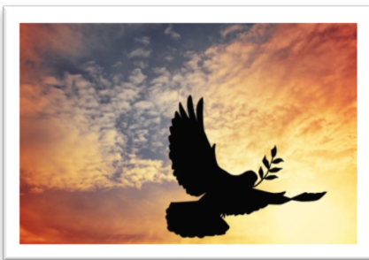
Global Peace Project

For more information, visit: http://www.acet-global.com/csr.html