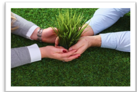
Global Entrepreneurship Project