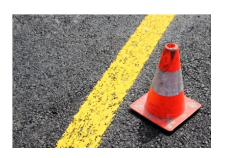
Global Road Safety Project